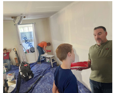
Mission Project at Bethany Baptist Church in Mississippi