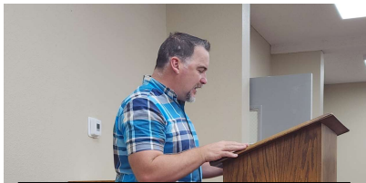
Preaching at a nursing home in Mississippi