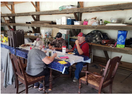
Celebrating birthdays while home for a couple days.