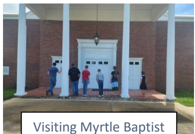
Visiting Myrtle Baptist Church

"He telleth the number of the stars; He calleth them all by their names. Great is our Lord, and of great power: His understanding is infinite."